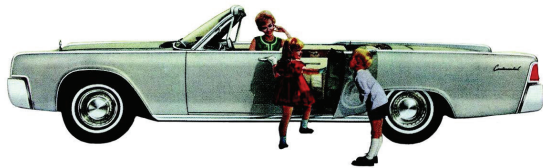
1963 Lincoln Continental Convertible

Infused with orange, vanilla and cardamon, fresh strawberries