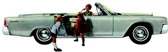
1963 Lincoln Continental Convertible

Warm custard soaked sponge cake, salted caramel gelato, hot fudge, whipped cream